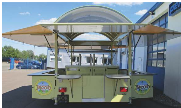
Arched roof (option)