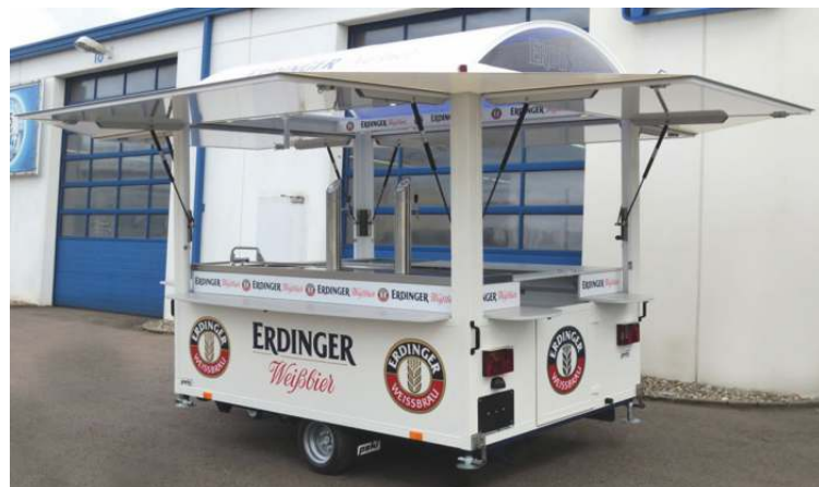
Typ 2700 KD with arched roof